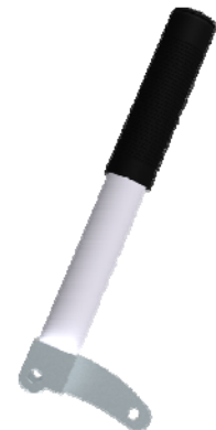
Vertical Handle & Actuator