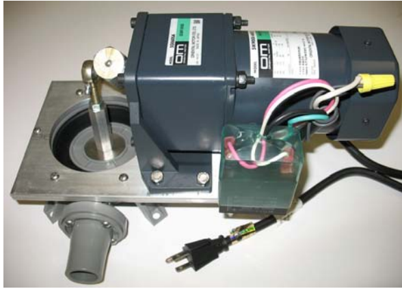
Figure 1. Final Assembly