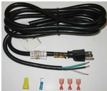
Figure 2. Materials