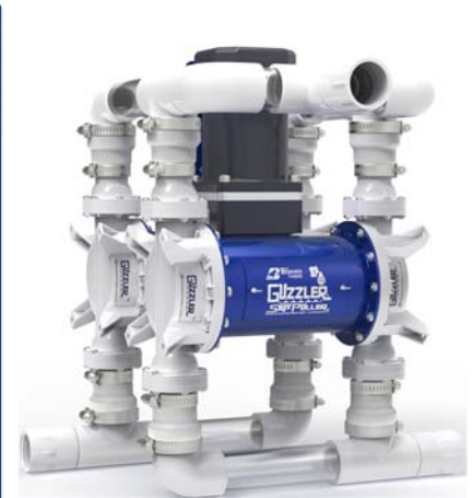
Shown with optional "split" inlet manifold to accommodate connections to two mainlines.