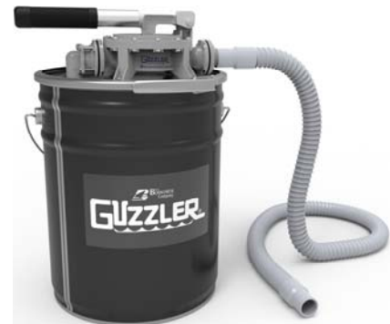
Available with optional steel pail with lever-locking lid