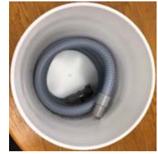
Hose stores neatly inside bucket when not in use.